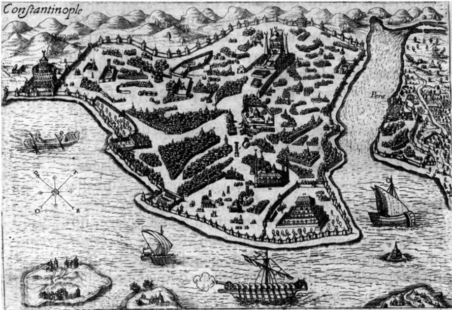
Figure 1. Pictorial map 'Constantinople'. Henry Beauvau, Relation iornaliere du voyage du Levant (Nancy: Iacob Garnich, 1615), 48.

covering the entire Golden Horn and most of the Bosphorus. Another remarkable point in Beauvau's map is that it depicts Istanbul in clusters, reflecting the city's early modern morphology; it then consisted of various spatial clusters or units such as neighbourhoods, palaces, monumental buildings and social complexes, as Beauvau had clearly visualized.