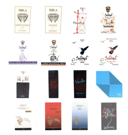
Figure 2. Labels investigated in determination of visual codes.

Content analysis is a research technique that describes the manifest content of communication in objective, quantitative and systematic way [22,29,37]. Each label is observed by codifying the visual attributes in terms of composition, layout, colour, typography, illustration etc.).