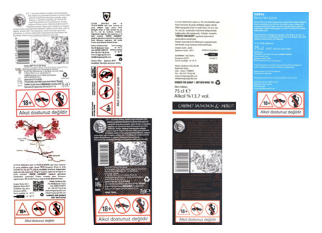
Figure 3. Back labels of the wine labels.