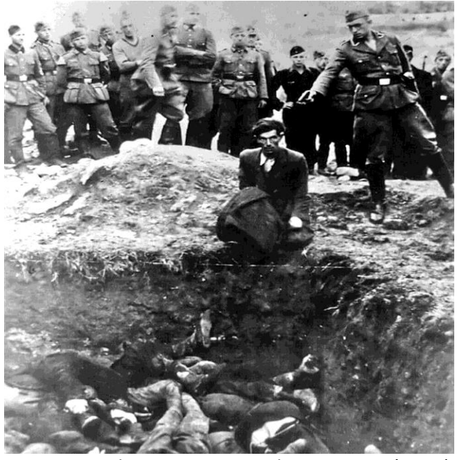
Figure 3: Unknown, Last Jewish in Vinnista (1941)

Using this road map the second visual that will be analyzed is this photograph, "The Last Jew in Vinnitsa, 1941".