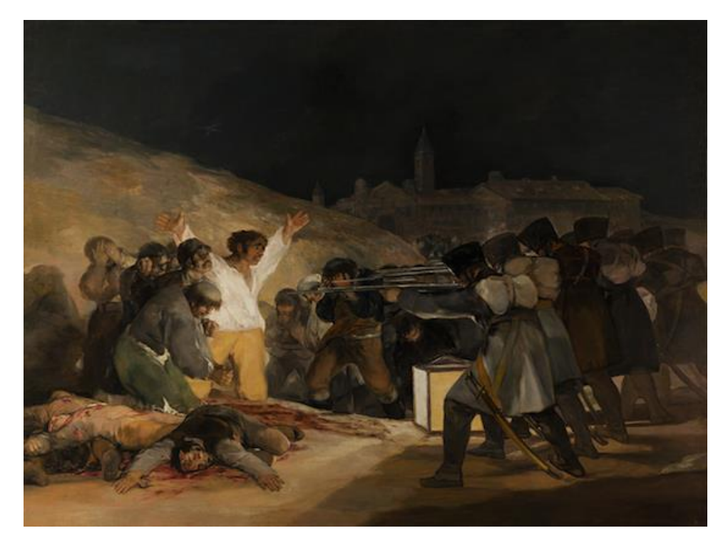
Figure 2: Fransico De Goya (1814), 3 May 1808