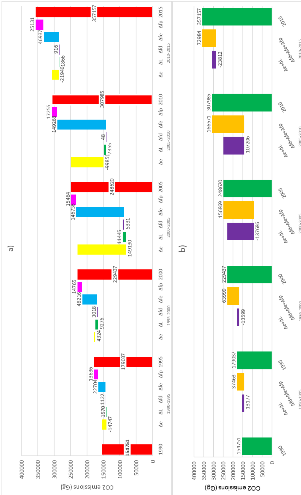
Figure 3: Decomposition results a) by each factor: e, L, fd, fe, fp b) production side factors (e+L) and consumption side factors (fd+fe+fp)

(e: emission coefficient, L: technology, fd: final demand structure, fe: per capita expenditure, fp: population)