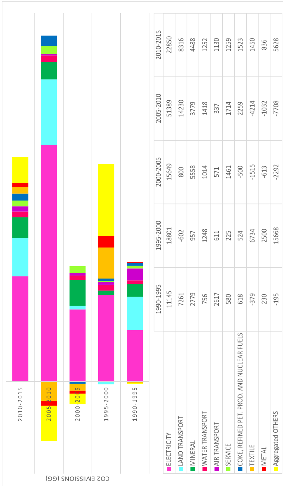
Figure 4 Sectors' contributions to CO2 emissions 10