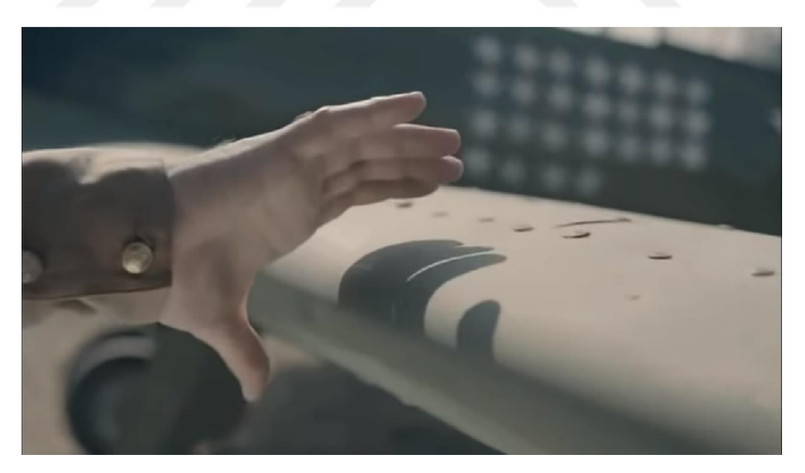
Figure 1: Ahmet-Han committing a ritual 'dance' around the plane. (Source: Telekanal ATR, 11 April 2019).

'Haytarma' gives credit to Amet-Han's unique pilots skills in several scenes. One of them is pronounced by his comrade as 'On the previous machine he made it till the aerodrome, with destroyed fuselage and hit engines. Such machine could not fly, but with him could'. In a moment before that scene Amet-Han carries out a kind of ritual by tenderly touching the newly received aircraft, that already has a mark in a form of eagle, which was the second nickname of the pilot. Eagle always fly high in the sky and nose dives towards its victim. This nickname was gained by Amet-Han for his ramming tactic, as one in the previous scene. While committing a ritual 'dance' around the plane, the cameraman captures the shadow from Amet's hand on the wing of the airplane, that resembles the shadow of an eagles wing. That once more emphasizes nearly mystical nature of the pilot's genius.