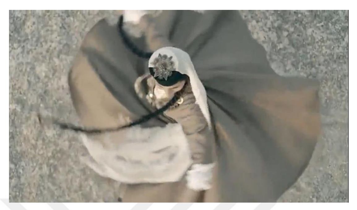
Figure 9: Crimean Tatar woman performing Haytarma – the dance symbolizing eternal circulation of life. (Source: Telekanal ATR, 11 April 2019).

We see the national dance two times during the film, both of them presage major plot twists. The first one is right in the beginning of the film. The Crimean Peninsula is celebrating the liberation from fascist army, the brave war hero and the son of Crimea returns to the homeland, all of these presages some chearing events of the film's first part. But when we see the second dance the storyline starts changing towards the tragic events of deportation, death and misery. So, according to the dance's implication, life has never-ending circulation of events, from good and pleasant moments to severe and full of sorrow and vice versa.