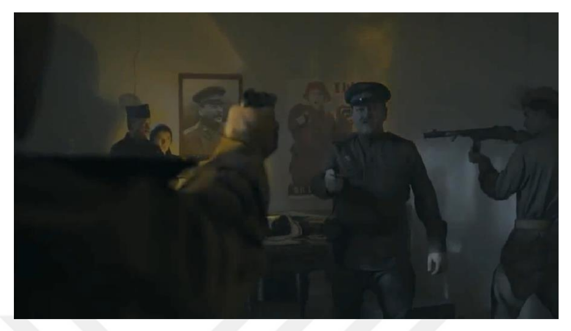
Figure 7: Stalin's portrait on the wall of command office.

Another character is NKVD captain Grigoriy Trunin. He gives order concerning forced eviction of Crimean Tatar population. For him people are not more than faceless mass of motherland traitors. He is also one who decides the destiny of Krotov, whose live is only a bunch of paper and documents in a file in his safe. After he orders to kill Krotov, he crosses out his file and put it back in the safe, which contain tens of ruined lives. Trunin represents the cold-blooded Soviet system, that along with thousands of Crimean Tatars' ruins millions of lives of various Soviet people that are unfavorable to the authorities.