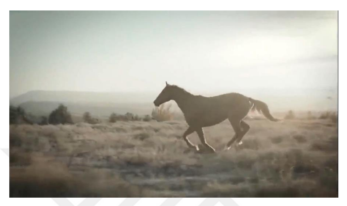
Figure 10: Running horse.

Life and death, happiness and misery, these binary concepts always go hand in hand during the film.