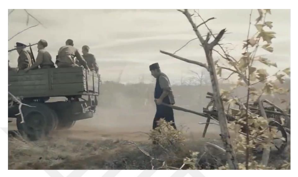
Figure 12: The old man carrying a cart.

the man takes a jug full of water, which is the symbol of life in many cultures.