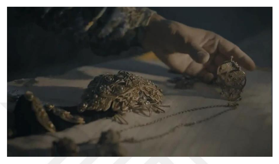
Figure 13: Crimean Tatar traditional items.

silver belt in front of the mirror. This belt is a traditional jewelry ( йипишли къушакъ) that was usually worn on the wedding day by the brides (RIA Crimea). Besides, this kind of belt is to protect a person from an evil eye.