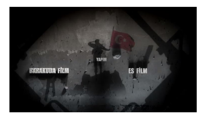
Figure 1: A Scene From the İsimsizler TV Series – Generic I

İsimsizler , one of the series to be analyzed, was first aired on Kanal D on March 27, 2017. Co-produced by Es Film and Barakuda Film, the series was dedicated Muhammed Fatih Safitürk, the former district governor of Derik, Mardin who was killed in the explosion of a bomb made and planted in his office by PKK. Unlike other politically-charged action series, it begins with the following sentence: "Real events which took place during the fight for the homeland are depicted in this series".