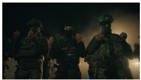
Figure 5: A Scene From İsimsizler TV Series Praying Soldiers II

While these lines are heard, a hand wearing a police ring about to pull a trigger, a praying woman, and a person waving the Turkish flag can be seen in the scene. The speech made in the first scene of the series made by a character shown to be a