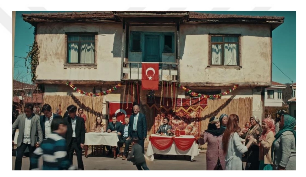
Figure 18: A Scene From Söz TV Series – Marriage Ceremony

In Söz , as well, the local community supports 'us' while being displeased with the presence of 'them'. In one of the scenes, a commander asks a girl's hand in marriage on behalf of a man from the village and invited to the wedding as the guest of honor. In another scene, a shepherd offers his own water to the soldiers recently returning from a conflict, shows a shortcut to their destination, and has them as guests in his house until morning. These scenes display the local community's support of the state and the soldiers who are the representatives of the state.