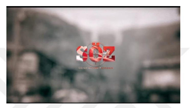
Figure 3: A Scene From Söz TV Series - Generic

Söz: Gözün Arkada Kalmasın is aired on Star TV and produced by TIMS&B Productions, who also produced Muhteşem Yüzyıl (The Magnificent Century) and Muhteşem Yüzyıl: Kösem (The Magnificent Century: Kösem). Through handovers, Star TV became known as a television network having close ties with the government.