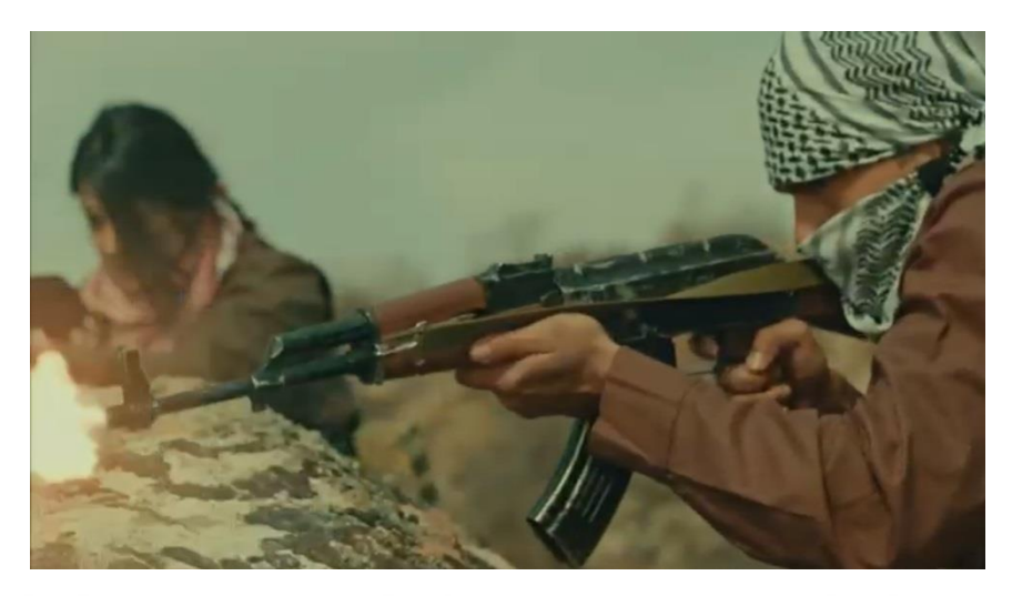
Figure 14: A Scene From İsimsizler TV Series – Representation of the 'Enemy'

The series conveys the idea that the Western world, against Turkey and its interests, do not want a strong Turkey and thus support terrorist organizations against Turkey.