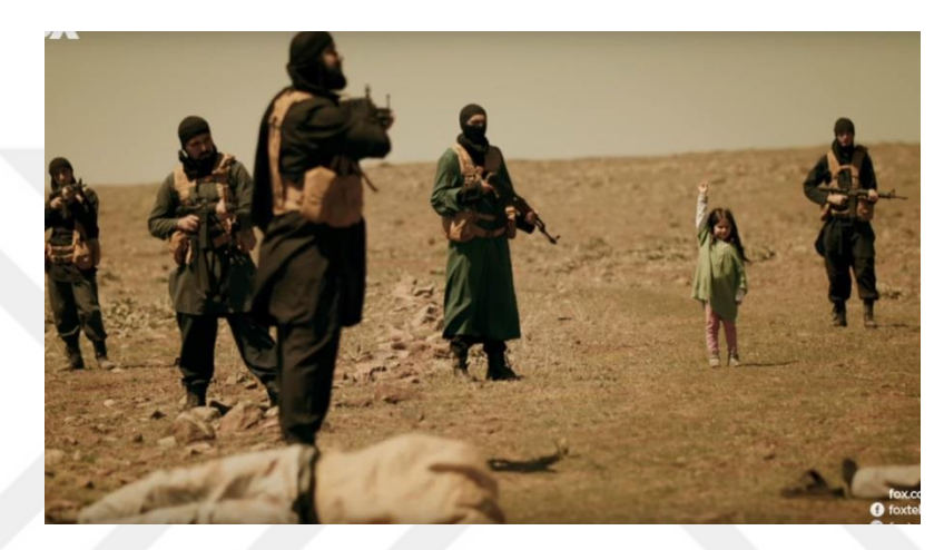
Figure 15: A Scene From Savaşçı TV Series – Representation of 'Us' and 'Them' I

In a scene from Savaşçı , as a terrorist executes innocent people one by one until he gets the answer he wants and is about to kill a child, a Turkish soldier comes to the rescue.