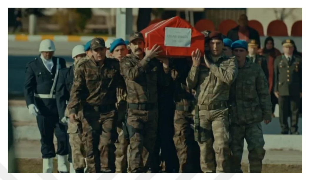
Figure 6: A Scene From İsimsizler TV Series – Funeral Rites

In isimsizler , the lyrics of the song played during scenes of operations and armed conflicts manifest clearly the Turkist point of view of the series. The song used in these scenes is named "Türk Kanı (Turkish Blood) and it was written by the Kazakh band Er Turan. The dominant Turkish-Islamic ideology in the series also becomes apparent upon translating the lyrics into either Turkish or English: "Geri dönsün ulu günler / Hun'un Allah ömrünü ver / Bölüneni kurtlar yiyor /Birleşiniz, birleşin sizler... Kime gerek yetim başın / Yurdun için doğrulasın /Turan oğlu gevşemesin / Turan tuğu yere yığılmasın... Kimler seni zapt edebilir / Er İdil'in dölleri / Yeniden doğan Alp yiğit / Yeniden coşar Türk kanı" (May the great days come back / May Allah give life to Hun / The wolves devour the separated / Unite, unite, all of you... Why be all alone / May you rise for your homeland / May the son of Turan never fade / May the son of Turan never fall to the ground... Which man can ever defeat you / O the spawns of Er İdil / Hero reborn / Overflows once again the Turkish blood)