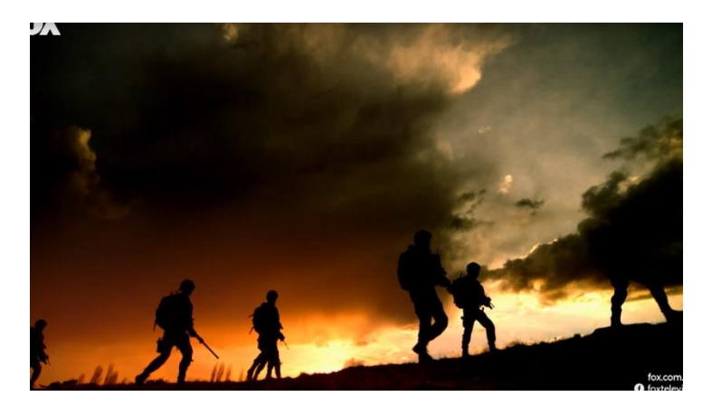
Figure 20: A Scene From Savaşçı TV Series – Heroism of the Military II

For example, in a scene in Savaşçı , the soldiers conducting an operation point their guns to the sky and recite the Turkish Commando Oath in unison. This oath is known for its vivid depiction of the heroism of the Turkish military. The lyrics to the song are as follows: "Korku nedir bilmeyiz / Biz dağların erleri / Yuva yaptık göklere / Baş döndüren yerlere / Engel tanımaz aşarız / Yüce engin dağları / El verir uzanırız / Mor siyah bulutlara / Ben Türk komandosuyum / Düşmanı çelik pençemle ezerim / Her yerde ben varım / Havada / Karada / Denizde / Çölde / Batakta / Çatakta / Her zaman ve her yerde / Allah Türk komandosunu korusun / Amin (We do not know what fear is / We the privates of the mountains / We have made homes at skies / To dazzling places / We proceed, no obstacle can stop us / Not even great mountains / Together we reach with our hands / The clouds purple and black / I am the Turkish commando / Crushing the enemy with my steel claw / I am everywhere / At the skies / On land / At sea / At the desert / At the marshes / In the streams / Anytime, anywhere / May Allah bless the Turkish commando / Amen)"