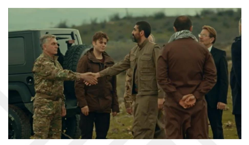
Figure 12: A Scene From lsimsizler TV Series – 'Internal and External Enemies' Cooperation

hard to overthrow through politics. We need to destabilize it and spark a civil war. Besides, you need to reinforce our armies as well... You just want to have a costefficient army to protect your energy lines." Foreigner: "A country in exchange for a simple task of protection."