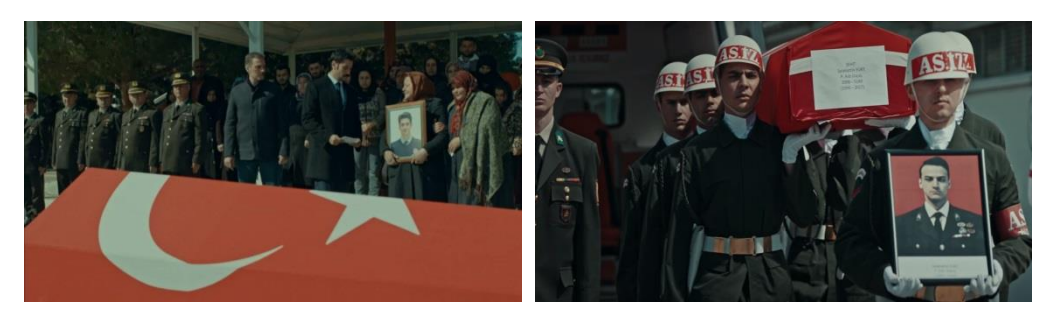
Figure 8 : A Scene From İsimsizler TV Series Martyr Funeral