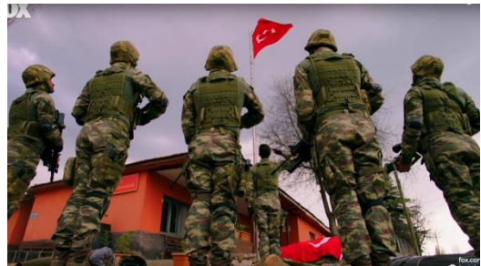
Figure 10: A Scene From Savaşçı TV Series – Flag Scene I