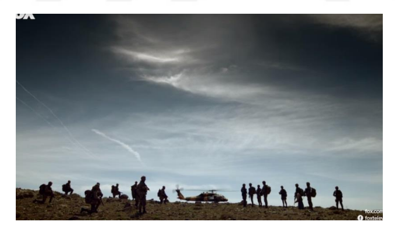
Figure 19: A Scene From Savaşçı TV Series – Heroism of the Military I

The characters, the soldiers and police officers, are well-trained and capable of fighting dozens of enemies by themselves. All of them are ready to give their lives for their homeland. This reassures the local community of their future safety as the state secures the future of the region with the help of 'gallant' soldiers and police officers.