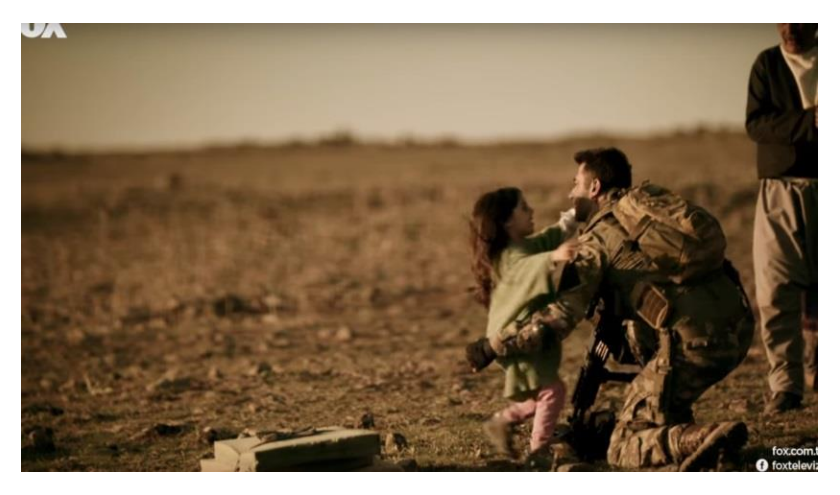
Figure 16: A Scene From Savaşçı TV Series- Representation of 'Us' and 'Them' II