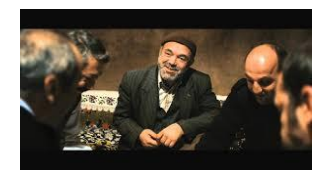
Figure 9. Muhktar speaks about the necessities in town.-"Once Upon A Time in Anatolia" (Source: Uzuner, 2015).

The Muhktar tells the officials, prosecutor and the commissioner, all the problems of the village, the electricity cuts off. They keep waiting in the dark and experience the difficulty caused by electricity shortages. Everyone complains about the situation. Despite the village's problems Muhktar emphasizes his love forthe village. Muhktar immediately brings the gas lamp, which is insufficient for the home. Although these state officials witness the problems in the village, neither the prosecutor nor the commissioner show any response. Instead, they blame Muhktar's greediness.