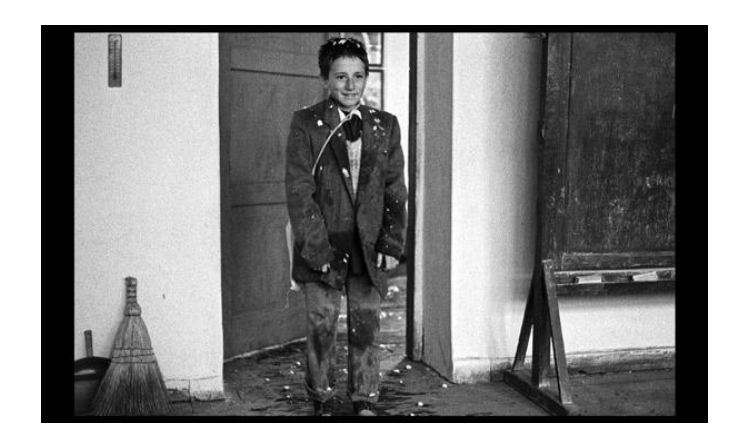
Figure 1: İsmail arrives in the class. - "The Small Town" (Source: Turan, 2011).

A mosque's images, an old house, a man praying, empty streets and the image of a very old man are given in succession in the film. The old man is sitting in an old house with his walking stick. He has deep lines on his face; the close-up shots highlighten his face. Ali throws a stone to the old man and he does nothing in return. The rural life is shown through these scenes; stagnation and the unresponsive old man in the film. In addition, the rural life is about calmness, old age, conservatism and stability stereotypes.