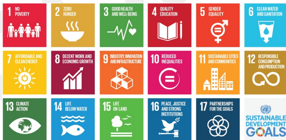
Figure 3. The 17 Sustainable Development Goals

The SDGs constitute a significant change from the MDGs, not only in the number of goals and targets, but also in their purpose, conceptualization, and the political process leading to their development (Fukuda-Parr, 2016). Because of the growing urgency of global sustainable development, the SDGs concept has fast gained traction. Sustainable development embraces the so-called triple bottom line approach to human wellbeing, however, definitions of this differ. Almost all of the world's societies agree on the need to achieve a balance of economic growth, environmental sustainability, and social inclusiveness, although the specific goals vary internationally, between and within cultures (Sachs, 2012).