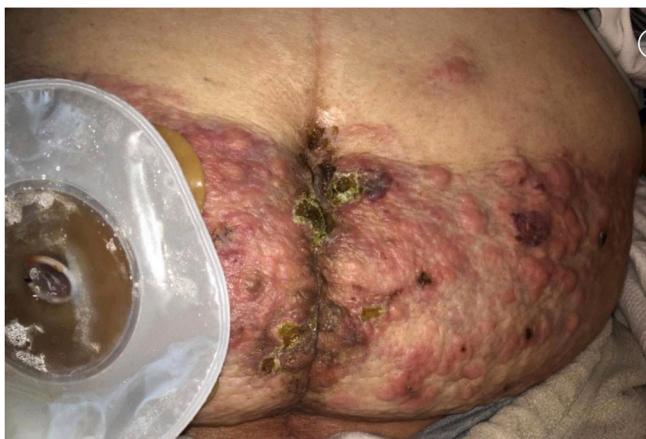
Fig. 1. Multiple cutaneous metastases on abdominal wall.