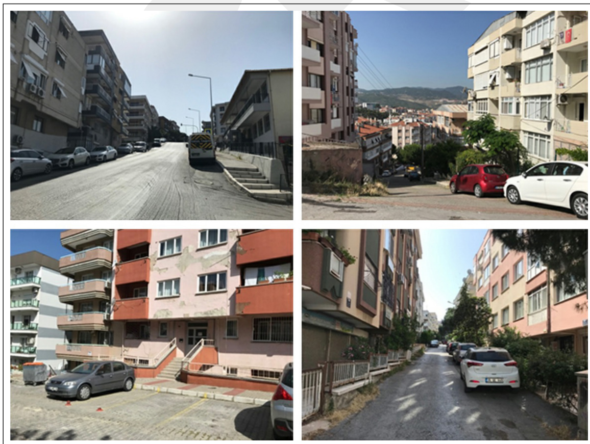
Figure 2. Views from the neighbourhood.

In the preliminary stage, interviews were conducted with the school administration and the classroom teachers to inform them about the process, and to reach an agreement about the study protocol. As a result, it was decided that two class hours would be enough to complete the tasks in each classroom. The protocols were prepared for the introduction parts of the questionnaires, story writing and drawing to ensure uniformity in explanations given to each class. The study carried out a quantitative approach using questionnaires which include close and open-ended questions. The questionnaire was designed to capture children's perceptions and use of their outdoor