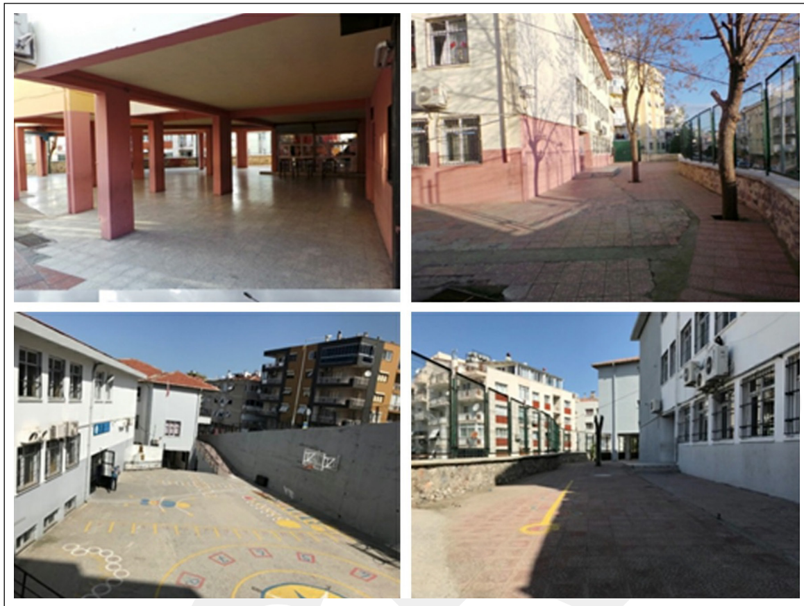
Figure 3. Views from the schoolyard.

development and influences learning and creativity through discovery (Flouri et al., 2014). Children mainly prefer to play on the streets even when neighbourhood parks and playgrounds are available locally. This is a finding with positive implications because playing on the street can be interpreted as having increased levels of independent mobility, physical activity, socialisation, and unorganised play opportunities (Ekawati, 2015). Similarly, we found no significant differences with regard to having children's park or playground near home within walking distance and spending time outside and watching TV or using technological devices (Table 5).