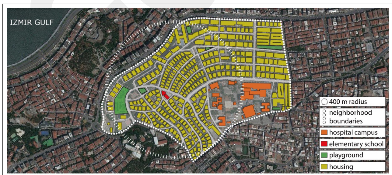
Figure 1. Basinsitesi neighbourhood.

Our research tools include drawing and story writing tasks for children and two questionnaires one of which was addressed to students and the other one to parents. The questionnaire consisted of a mixture of close and open-ended questions to understand children's and parents' perceptions and thoughts as had been previously used in many studies (Kyttä, 2002; Li and Seymour, 2019; Loukaitou-Sideris and Sideris, 2009).